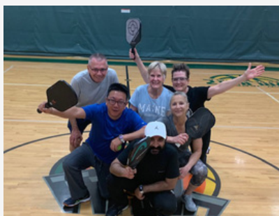
Premier Predators 3.0

Over 100 players from Premier participated in the Allstate Pickleball League which ran for ten weeks from April - June. This was the first opportunity for many of our players to participate in a tournament level environment. We couldn't be more proud of the way all our players represented Premier both on and off the court.