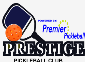
IT'S OFFICIAL NEW INDOOR COURTS COMING SOON!