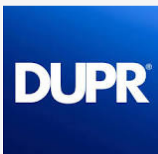
RATING VS. RANKING