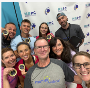
4.0 ALLSTATE CHAMPIONS