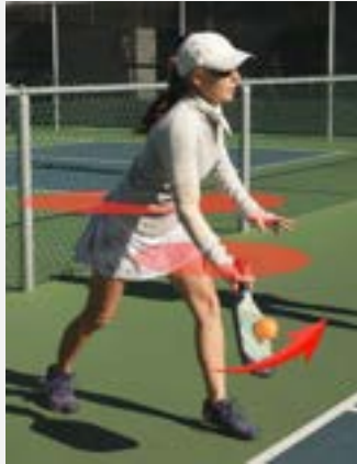
Figure 4-3 (legal serve)