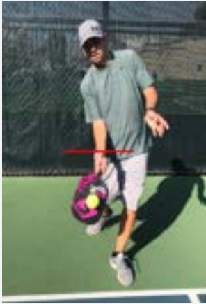
Figure 4-1 (legal serve)